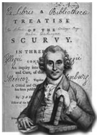
Figure 1. James Lind (1716–1794).

operation is overseen by 3 part-time consultants with administrative support, all primarily laypeople. Organizations and individuals that support the JLA's aims can join as affiliates, via www.lindalliance.org , and will receive a quarterly newsletter. Currently, the JLA has almost 200 affiliates.